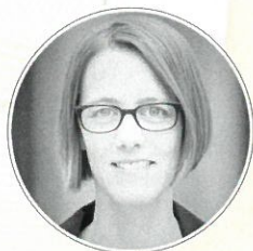
DIGITRANS project manager